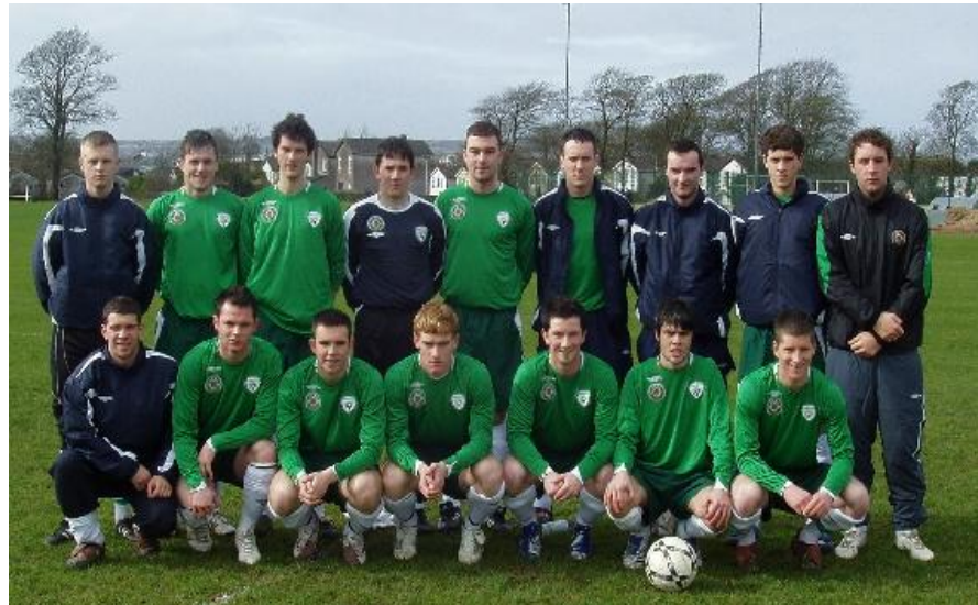
CFAI National Squad 2008

A panel of thirty players were invited to a development session held in Dublin on 16th of February. Following this session the management of the CFAI squad have finalised their squad and stand-by squad for the forthcoming season. .