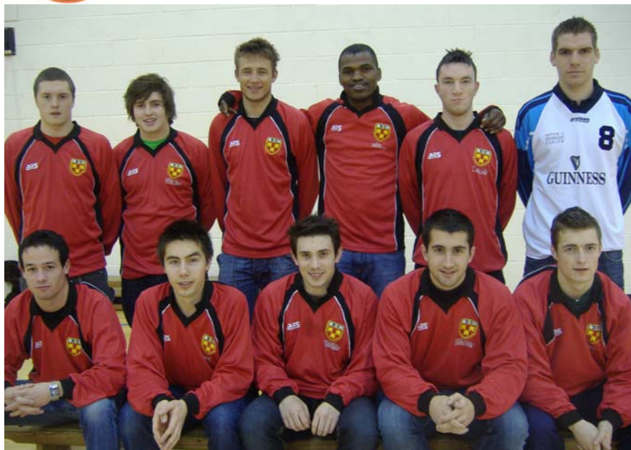
IT Carlow 2009