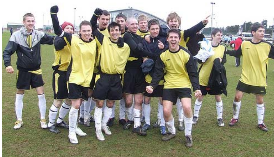
Inchicore Celebrate winning the UMBRO Colleges Plate 2008