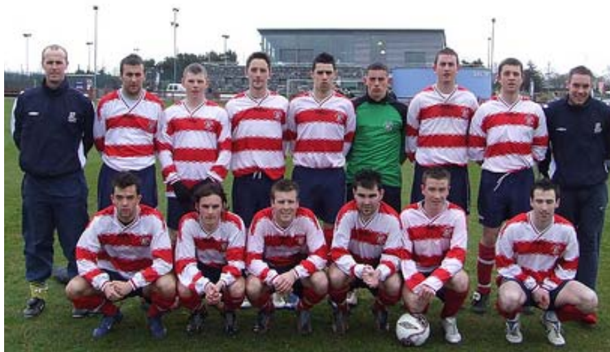
Cork Institute of Technology Cup Winners 2007