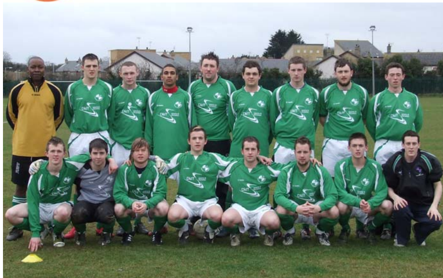
Dundalk Institute of Technology 2009