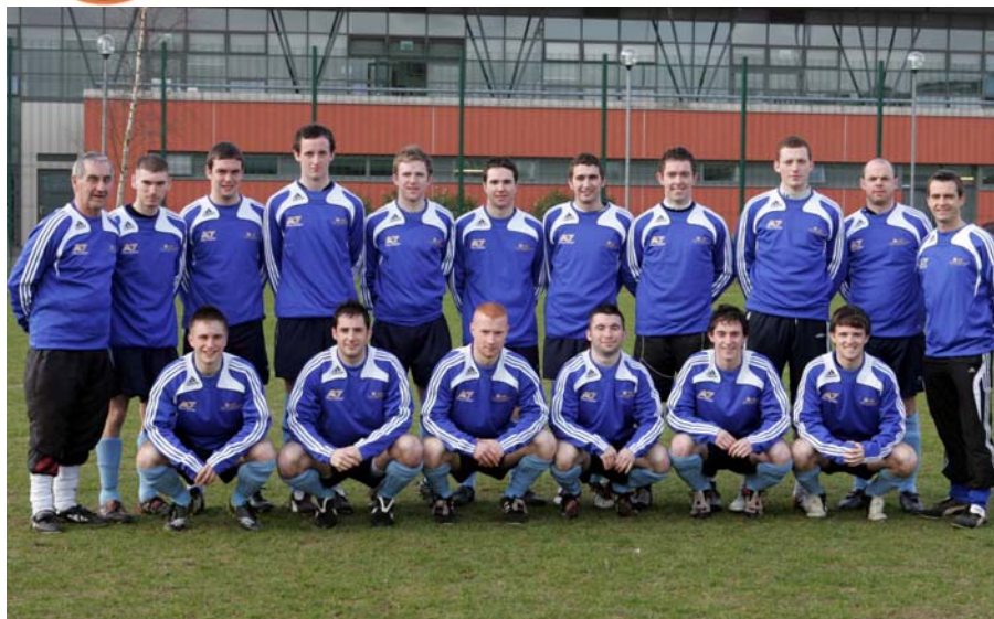
Letterkenny IT 2009