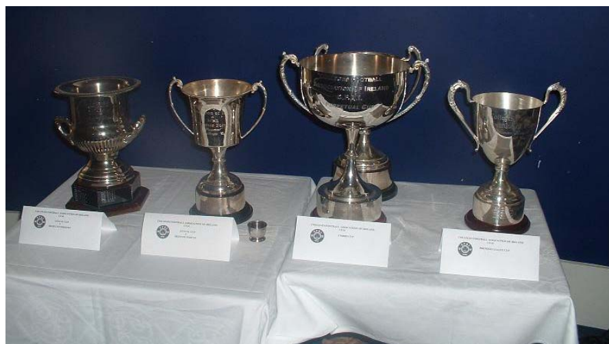
The Silverware up for grabs