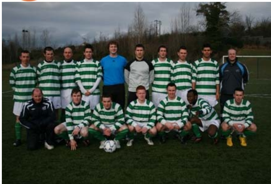
Athlone IT 2009