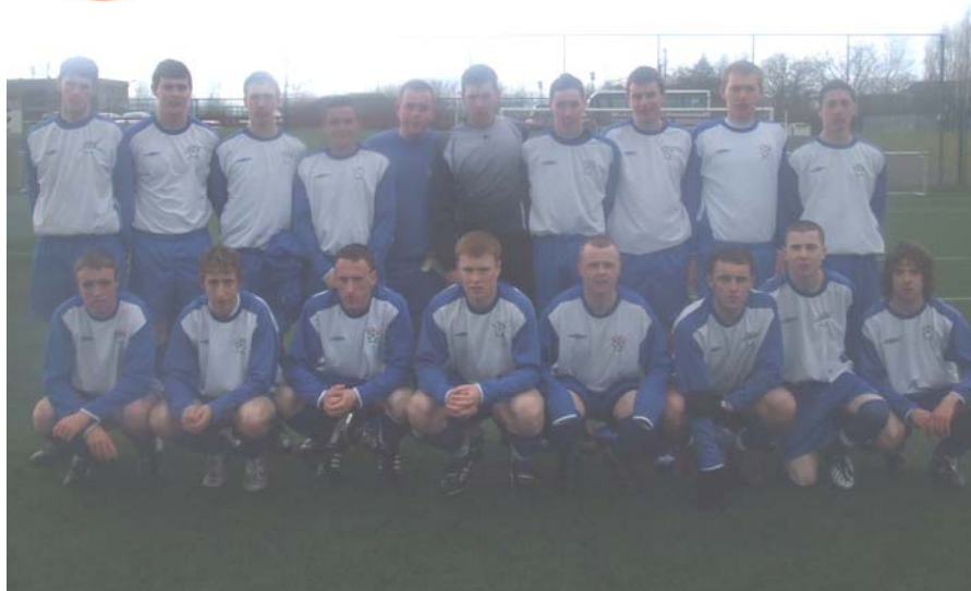
Colaiste Ide B 2009