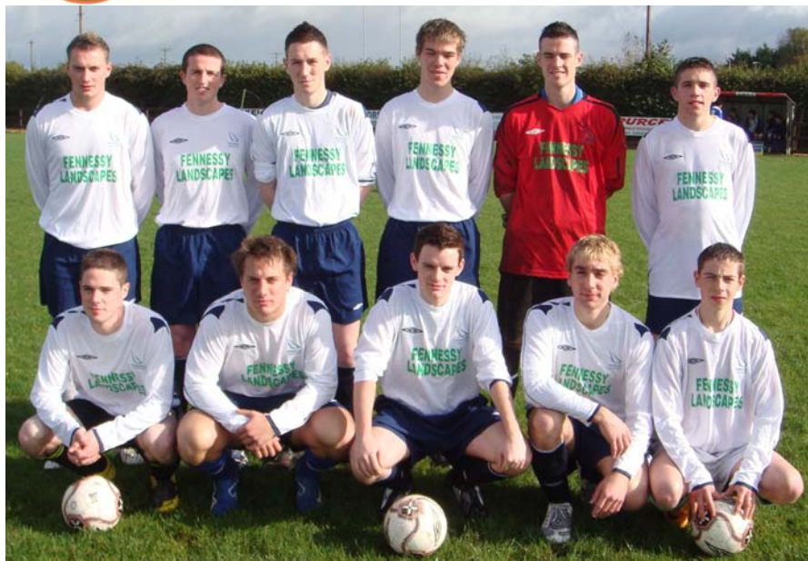
Tipperary Institute 2009