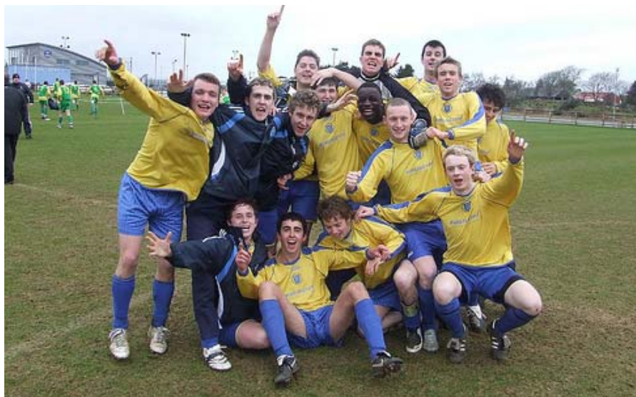
B Team Cup Winners 2008—Dublin Institute of Technology