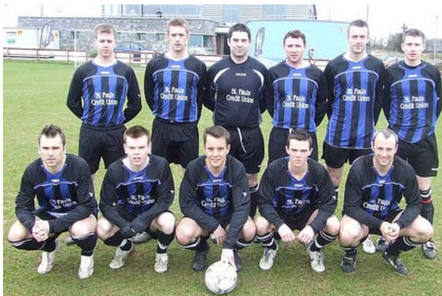
Garda College 2008 UMBRO Colleges Cup Winners