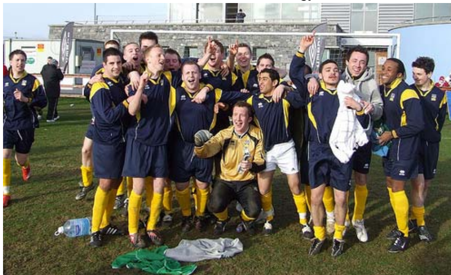
Bob Eustace Cup Winners 2008—Senior College Dun Laoghaire