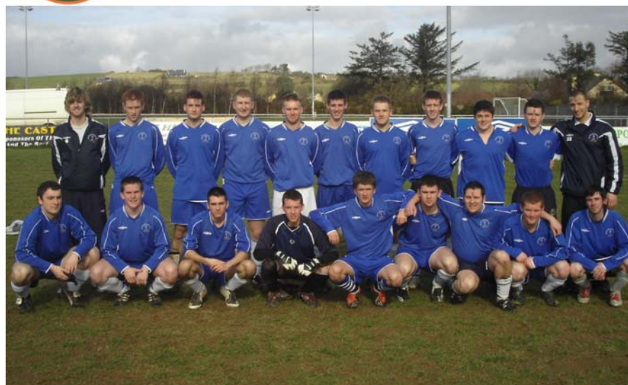
Institute of Technology Tralee B 2009