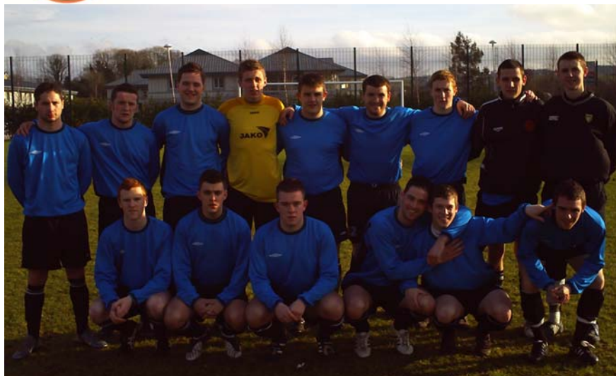
IT Sligo 2009