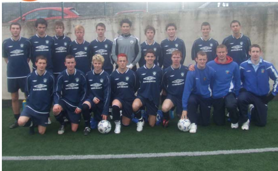
Colaiste Ide A 2009